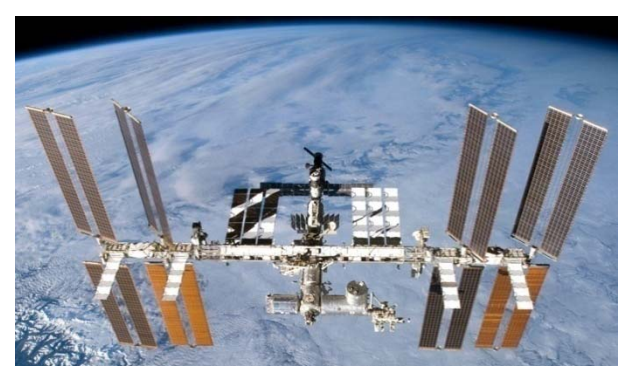
Figure 4. International Space Station.

Example: Applying space architecture approach to a housing process