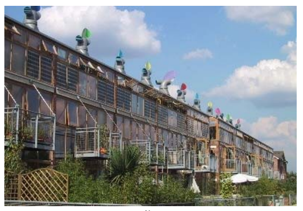
Figure 5. Image of BedZED<sup>41</sup> (UK). The project uses only energy from renewable sources generated on site

• The evolution over long periods in time of those energy protocols and techniques: how different technologies work together during an extensive period, and how they last. Their standards are not the same as those of space programs, although their materials, interactions, protocols and software could be the same.