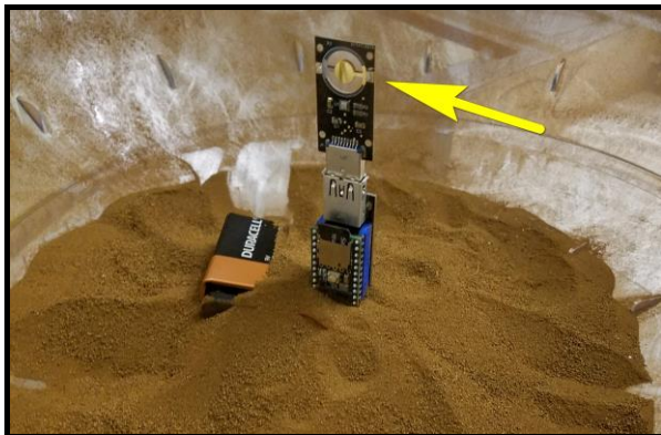
Figure 1. QCM brassboard instrument testing in a simple dirty vacuum chamber. Arrow points to round quartz crystal resonator.

Introduction: Dust is the primary environmental problem on the Moon, an issue that has been recognized since the Apollo era. Dust in the lunar environment is troublesome for both humans and equipment because of its strong adhesion, cohesion, and complex mechanical properties. For instance, it could cause thermal issues, or additional wear and abrasion complications on mechanical components. For humans (or astronauts), repeated dust exposure irritates the eyes, ears, nose, and throat and can damage the lungs. We are developing a Quartz Crystal Microbalance (QCM) as a tool to measure real-time lunar dust accumulation rates and deposition (Fig. 1). A QCM measures a mass variation in grams per second by measuring the change in frequency of a quartz crystal resonator.