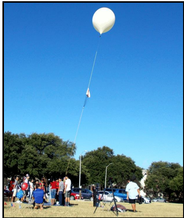
Figure 2. Our high-altitude balloon flight (14 June 2018) included breadboard QCM testing.

Modified from a commercial off-the-shelf (COTS) QCM device, our QCM payload has been in development for the last 18 months as a student “payload to the Moon” program. The breadboard instrument configuration has achieved a rating of Technology Readiness Level (TRL) 4 through a stratospheric (120,000 ft.) balloon flight experiment for which we have done sensor calibration and interpretation of measurement data (Fig. 2).